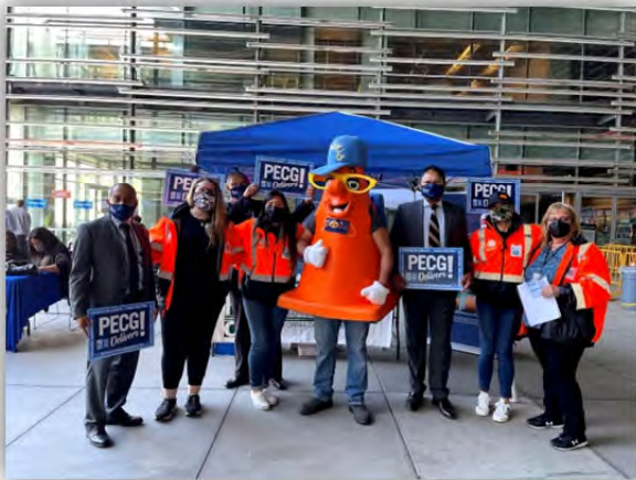
Caltrans HR Staff in Orange with Section Officers