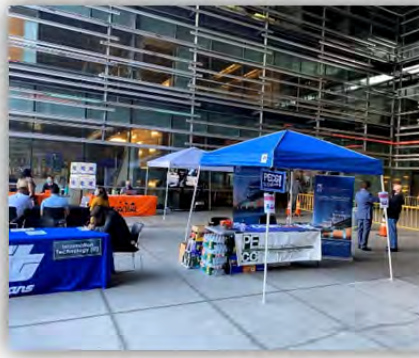
PECG Sponsored booth