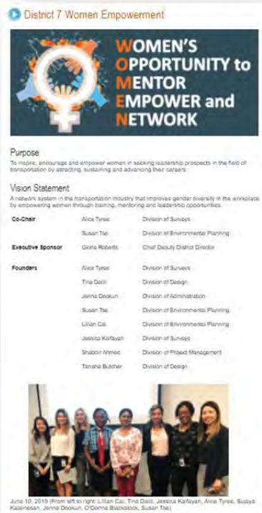
Caltrans D07 Founding Members