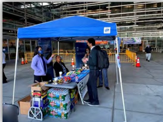
Caltrans Career Fair attendees