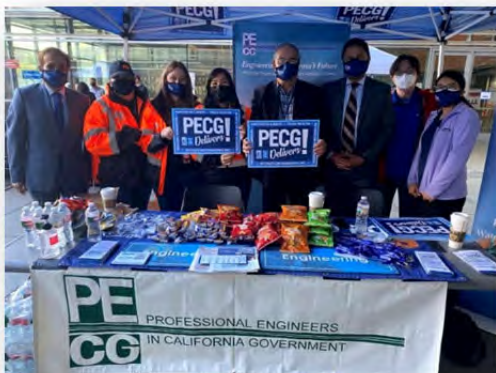
Caltrans HR Staff in Orange with Section Officers